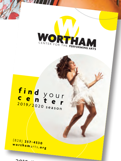
2019/2020 Playbill Cover

Playbill ads are distributed for the entire 2020/2021 season, for just one price. Competitive rates help you reach this desirable consumer with a full-color message. And perks like free tickets to performances sweeten the deal.