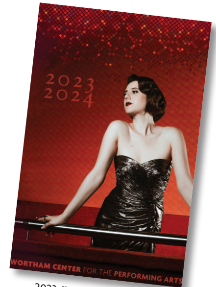
2023/2024 Playbill Cover

Payment, ad contract and ad materials due August 16